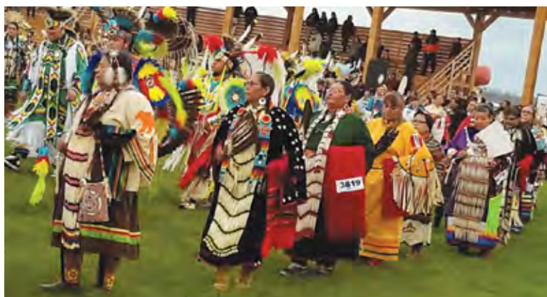
Members Dancing in Grand Entry