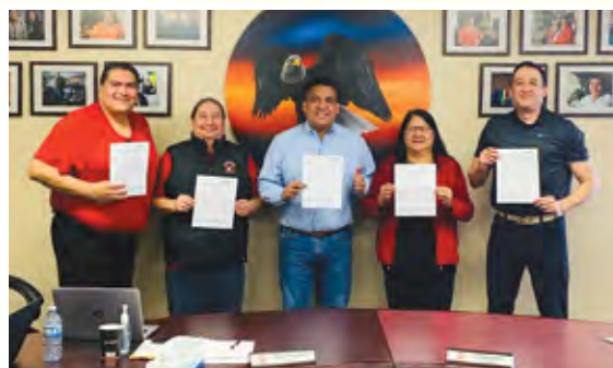
Drug test that Chief and Council successfully passed in February, 2020.