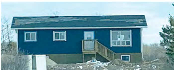
Stick built home

onto the reserve and the two stick builds will be completed by April 2020, but have not yet been allocated to families.