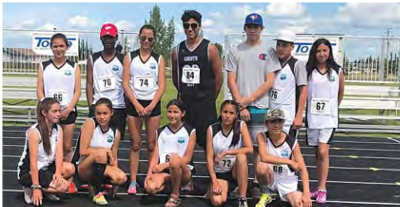
2019 Summer Games athletes

Our Storm 2019/20 hockey season came to a sudden halt, but we would like to give coaches, volunteers and fans a big thank you!