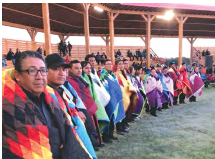
Honouring of Fire Department from 2018 Pow-wow