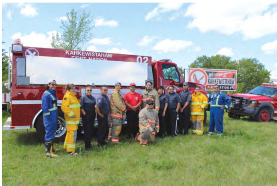
New fire truck and our brave Fire Department members