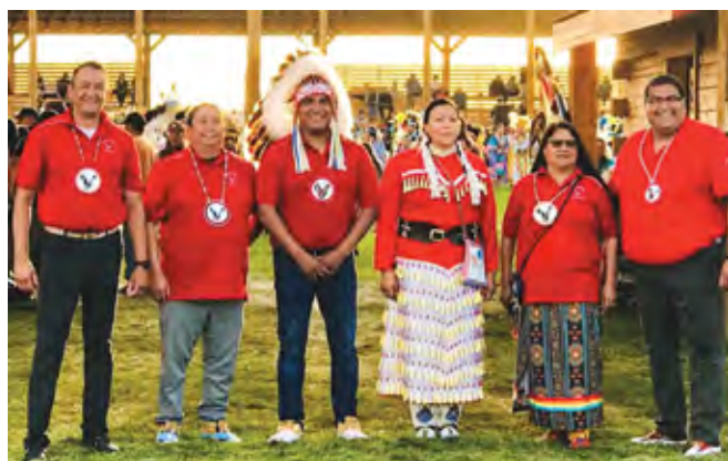
Chief & Council and Executive Assistant